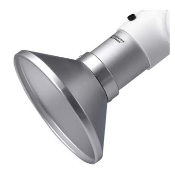
Suction hood; Diam 200 mm, white Product No.: 17524