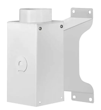
U-profile System 100 Product No.: 2195