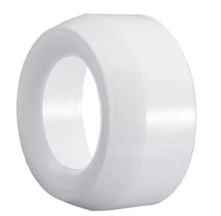
ALSIDENT Reducer 100 mm - 75 mm, white Product No.: 410075