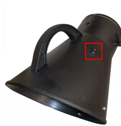
On/off switch via suction hood Product No.: 96313321