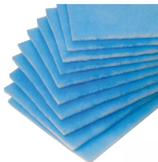
Pre-filter mats, pack of 10 Product No.: 10032