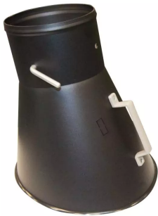
Exhaust ventilation hood, made from metal Product No.: 104901