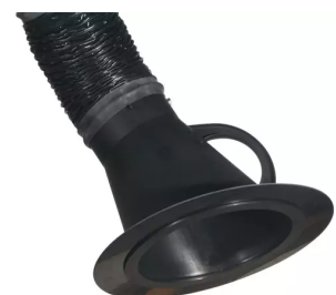
Adapter for extraction hood; diam 150 mm, Product No.: 66220