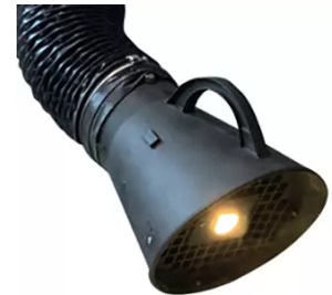
Lighting for 1 suction arm incl. hood Product No.: 96323