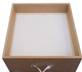
Particle filter F9, 610 x 610 x 292 mm Product No.: 10029