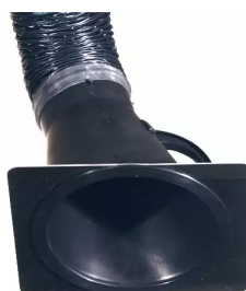
Adapter for extraction hood; diam.: 150 Product No.: 66210