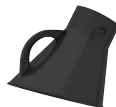
Exhaust ventilation hood diam. 150 mm Product No.: 66200

€191.00* (€191.00* for product 97300112)