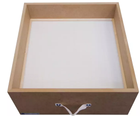
Filter cassette H13, filter surface: 14m 2 Product No.: 100357