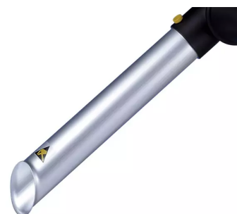
ALSIDENT pipe nozzle NW 50 (AS), antistatic, Product No.: 150316