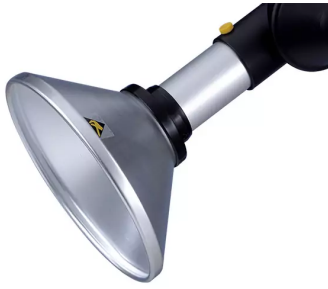
Suction hood DN50, round, antistatic Product No.: 150246