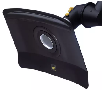
ALSIDENT Suction hood, DN 50, 330 x 240 mm Product No.: 15033246