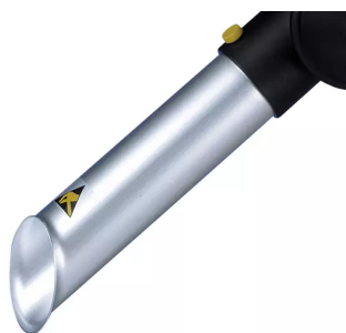
Extractor tube / antistatic Product No.: 150216