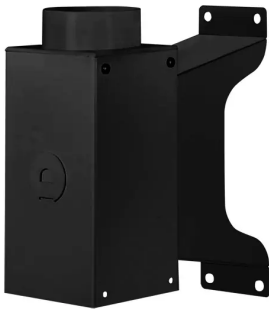
ALSIDENT wall bracket, DN75-50, black Product No.: 2195050