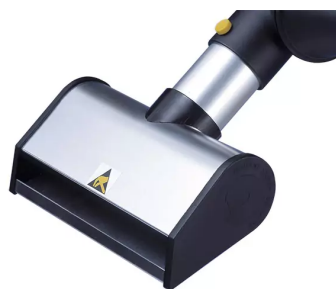
Alsident slotted nozzle DN50 mm (AS), antistatic, Product No.: 150206