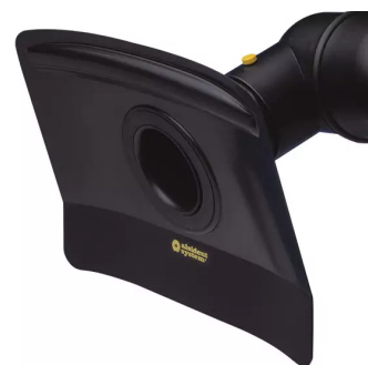
Suction hood, flat, antistatic version Product No.: 17533246