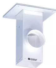
Ceiling column, white, System 50 Product No.: 225020