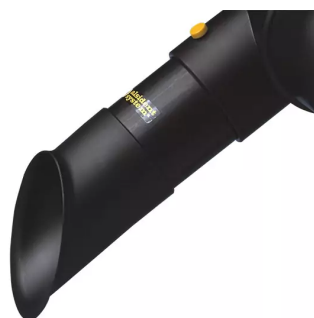
Extractor tube, anodised alu, diam. 75, antistatic Product No.: 175256