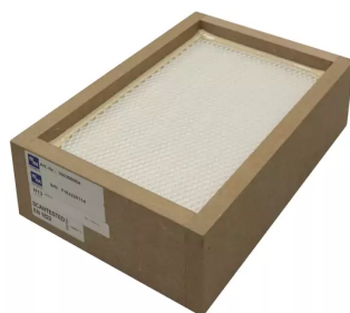
Hepa filter H13, size 337 x 230 x 100 mm Product No.: 100350004