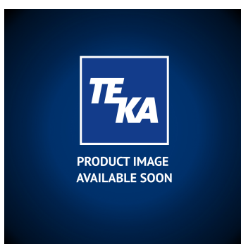
Activated carbon filter 337 x 230 x 212 mm Product No.: 97059