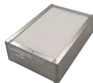
Ulpa filter U16, size 337 x 230 x 100 mm Product No.: 100350005