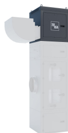
Option soundproof housing for FilterCube 4