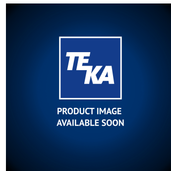
Extension set H13 filter for FilterCube 4 Product No.: 4000950144002