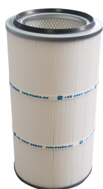
Filter cartridge, type standard, Product No.: 6160600110008