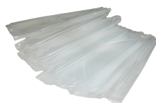
PE-bags (pack of 10) for Product No.: 10030251