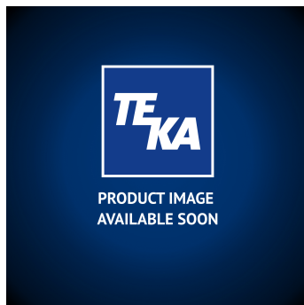
Adapter for FilterCube 4 of diam. 500 mm Product No.: 9501441940111