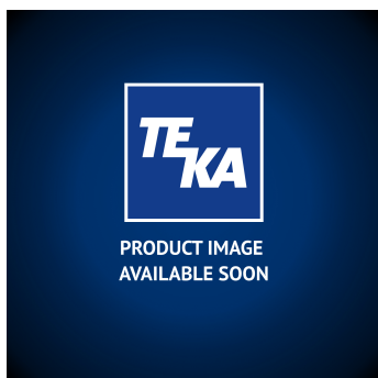
Transition piece 450 x 450 to diam. 355 mm