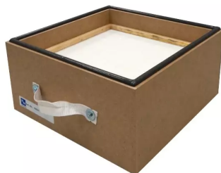
HEPA filter H14, 610x610x292 mm Product No.: 50202146629