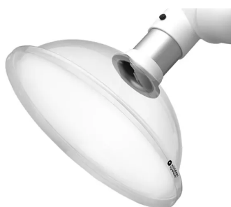
Suction hood; System 100 Product No.: 1100505