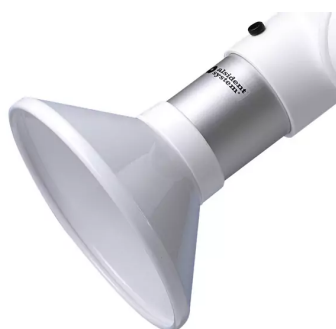
Suction hood size 100 mm Product No.: 1100245