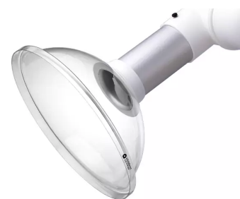
Suction hood for arm system 100 Product No.: 1100355