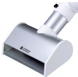
Suction nozzle 200 mm Product No.: 150205