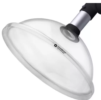
Suction hood; white Product No.: 15035050