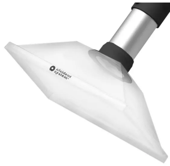
ALSIDENT Suction hood, DN 50, 200 x 150 mm Product No.: 1502015050