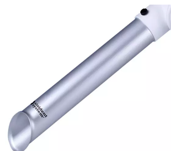
Tube nozzle, aluminium, DN 50mm, Product No.: 15031