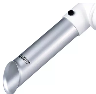
Extractor tube, anodised alu, diam. 50 Product No.: 15021