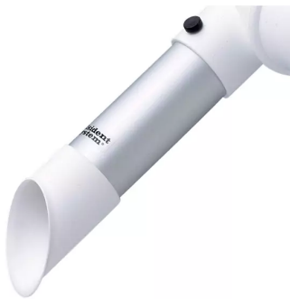
Extractor tube / antistatic Product No.: 150225