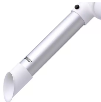
Extractor tube / antistatic Product No.: 150325