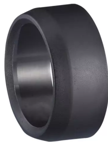
ALSIDENT Reducer 63 mm - 50 mm, black Product No.: 463506