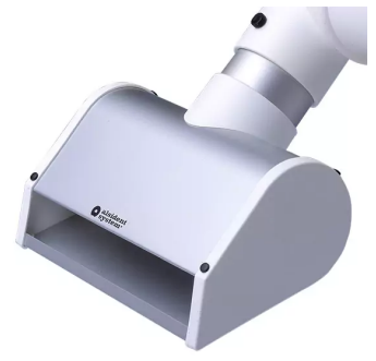
Suction nozzle 200 mm Product No.: 150105