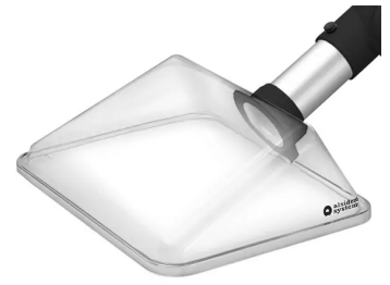
ALSIDENT Suction hood, DN 50, 245x220 mm Product No.: 1502422050