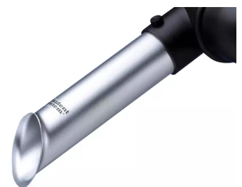
Extractor tube, anodised alu, diam. 50 Product No.: 15021001