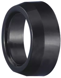
Reduction 80 mm to 50 mm Product No.: 480506