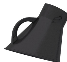
Exhaust ventilation hood diam. 150 mm Product No.: 66200