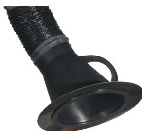
Adapter for extraction hood; diam 150 mm, Product No.: 66220