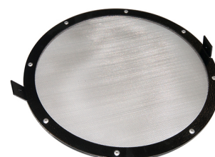
Protection grille (finely woven) for installation Product No.: 10372