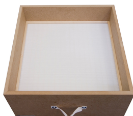
Particle filter F9, 610 x 610 x 292 mm Product No.: 10029