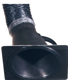
Adapter for extraction hood; diam.: 150 Product No.: 66210