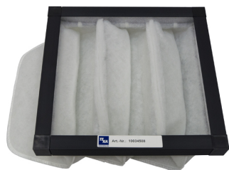
Bag filter, category G4 - 3 bags Product No.: 10034508