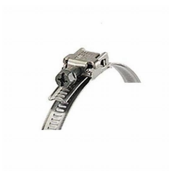
Hose clip, dia. 100 mm Product No.: 51184